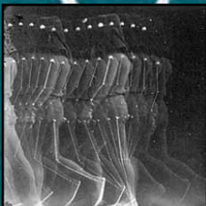
ÉTIENNE-JULES MAREY | FRANCE