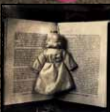
LAUREN SIMONUTTI | USA