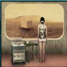
JULIEN PACAUD FRANCE