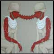
ESPIRA | UK