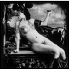
WITKIN | USA